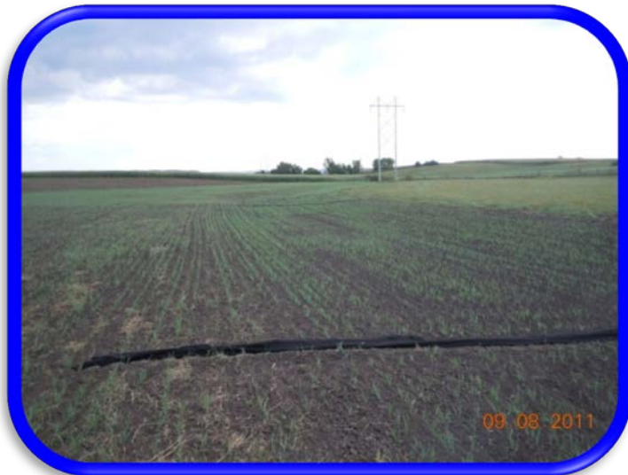
Waterway two weeks after construction, temporary cover (oats) emerging