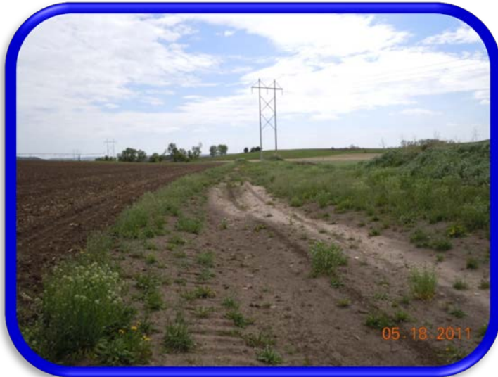
Pre Construction view of grassed waterway, looking south