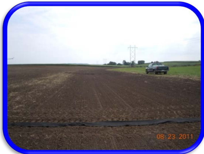
Final Graded waterway after fabric barrier installed and seeded