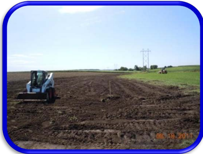
Construction view of grassed waterway during construction